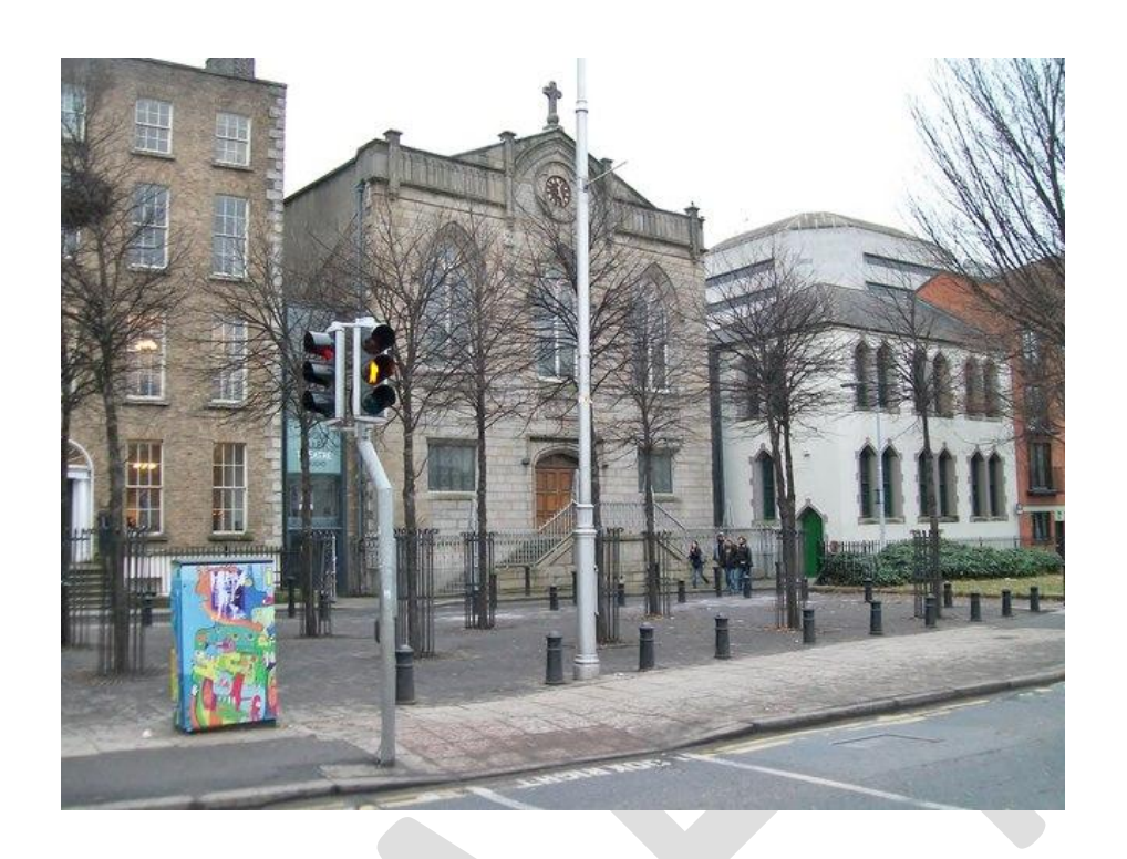
Figure: Ss. Michael and John Roman Catholic Church In Dublin, Ireland today.